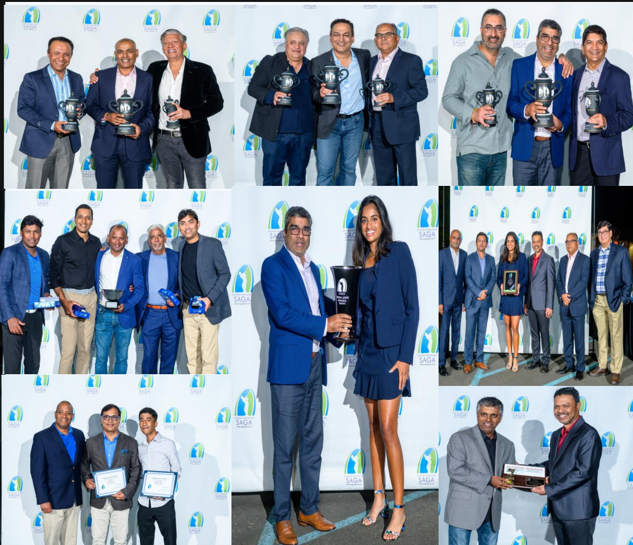
2021 SAGA Winners