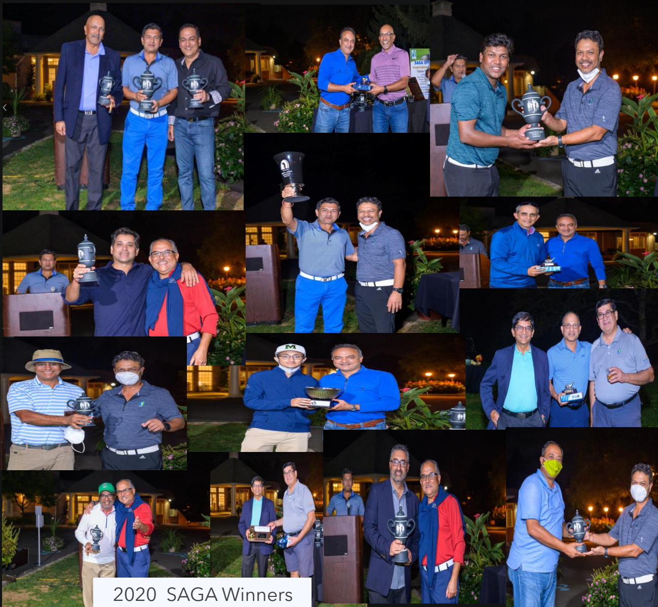
2020 SAGA Winners